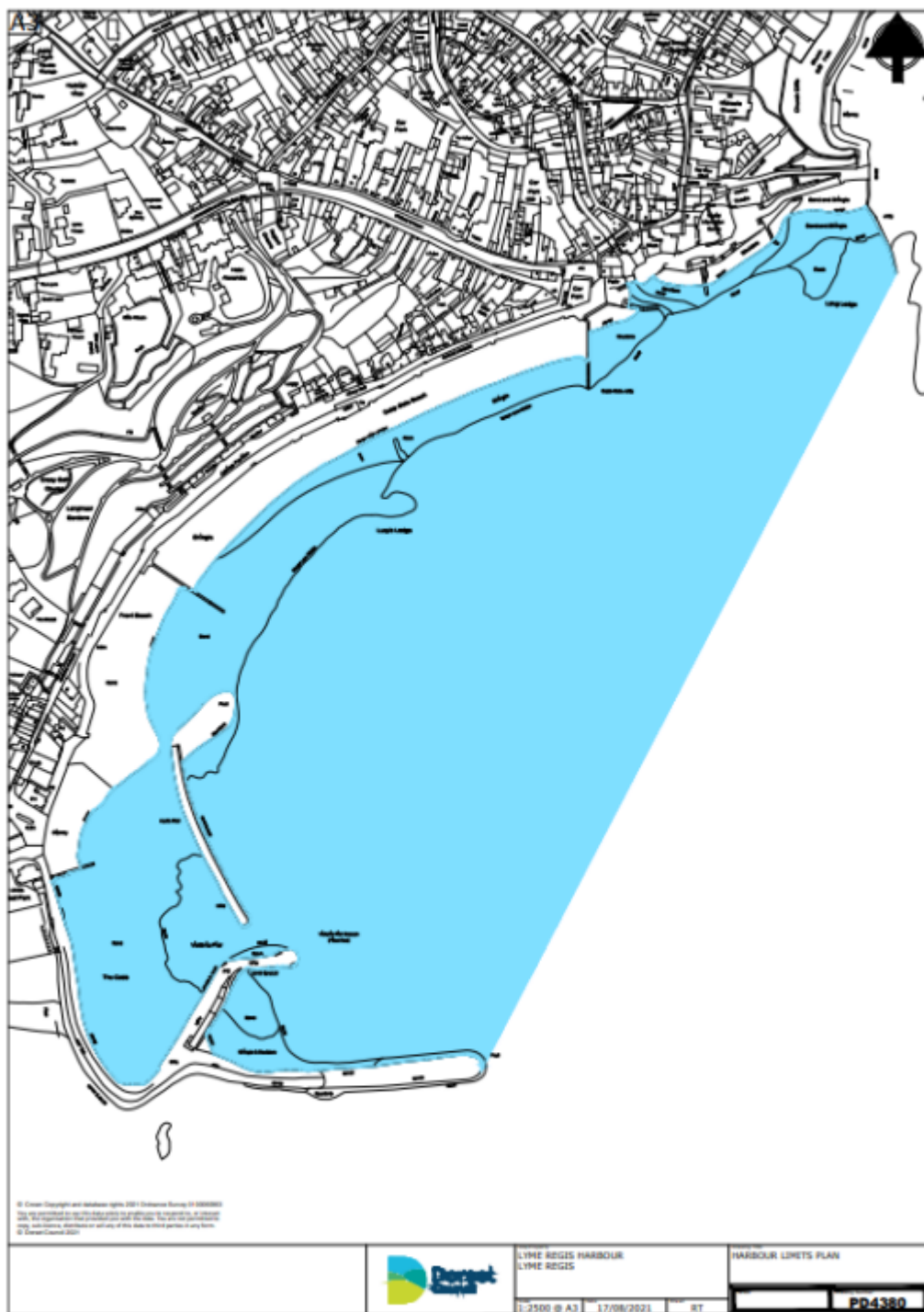
Figure 3: Lyme Regis Harbour Limits